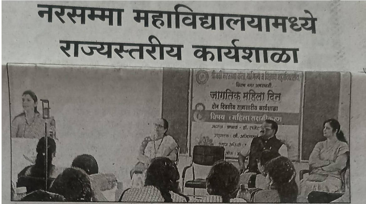
मंचावर उपस्थित मान्यवर

NOTE – also provide the photographs (in soft copy) of the event/activity.